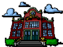
Teaching Children's Dental Health in a class room setting

This New Children's Dental Health Program has been designed for use in the classroom to help teacher's explain the often mysterious world of dentistry to their students. The classroom can serve as an immediate pathway to happy, healthy smiles for children who may have never visited a dental office before. The teaching exercises will give children positive, friendly images of a dental office, while explaining the range of emotions they may feel. Using these methods, educators will be able to allay any fears or misconceptions held by children who may need dental care the most.