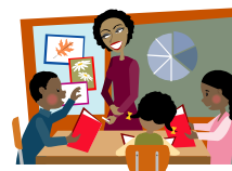
Reaching children within our own school system